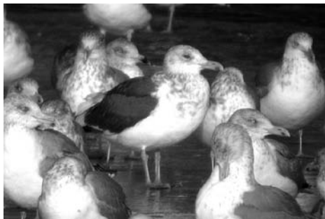
Slaty-backed Gull, 1/3/07, Rochester, NH.

A merican Coot was another beneficiary of the mild early winter conditions, with almost twice the number of records of last year. Powwow Pond again was the epicenter of coot occurrence with a one-day count of 116, almost double the number counted there at about the same time last year. American Woodcock is extremely rare in the winter season. An early December record was the first for the winter season since December 1998. Even more remarkable is that both records were by the same observer in the North Country!