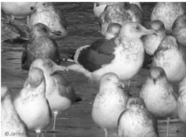
Slaty-backed Gull, 1/3/07, Rochester Wastewater Treatment Plant, Rochester, NH.

An American White Pelican reported on Great Bay in early December was quite remarkable. Two years ago an inland report of this species was the first winter season report. The state's second record of Eared Grebe appeared just before the start of the season and stayed through February 4. Black Vulture is being reported with increasing frequency in the state, but they are still considered rare and a winter record from Amherst in early December is quite unusual. A Gyrfalcon report from Dover is only our fourth record since 2001 (see the Spotlight on Gyrfalcon in the Winter 2005-06 issue). The Rochester wastewater treatment plant again produced some very exciting gull watching. From there, in January, came our likely second and third state records of Slaty-backed Gull —one an adult and the other a third-year bird. Three warbler records were outstanding: a Yellow Warbler in early December, an Ovenbird in late January, and a Cape May Warbler on December 1. A Lincoln's Sparrow report is rare for the season, with a Clay-colored Sparrow even more unusual. Rare at any season, the report of two separate Yellow-headed Blackbirds found on the same late January day was a remarkable coincidence.