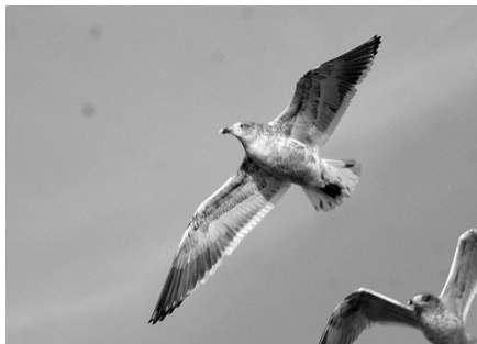
Slaty-backed Gull by Mike Harvey, 1/18/07, Rochester, NH.

Once extremely rare, Lesser Black-backed Gull continues to be an increasing feature of our wintering gull population. As many as five individuals were recorded at the Rochester wastewater treatment plant. Large numbers of gulls, including a remarkable high of 14 Iceland Gulls, frequent the treatment plant, which is adjacent to a large landfill. One of the most exciting birding events of the season was the appearance of Slaty-backed Gull at the plant. There appeared to be two birds involved, an adult and a third year bird. The birds were extensively studied and photographed. Pending review by the New Hampshire Rare Birds Committee, this would constitute a second and third state records. The first state record of the species also occurred at the Rochester wastewater treatment plant in December of 2003. This gull of the Eastern Pacific Ocean region is rare but increasingly reported from the west coast of the U.S. Records beyond that area are still quite outstanding.