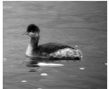
Eared Grebe

Certainly one of the rarest birds of the season was an Eared Grebe found in Rye. It was found on the last day of the fall season and was reported through February 4. This is only the second state record for this species and provided a first Christmas Bird Count record. American Bittern was again recorded this season with one report in early December and another in early January, when it is considered rare. Similarly to last year, the mild early winter conditions produced an abnormally high number of Great Blue Heron records. A single Black Vulture report from Amherst in early December was quite remarkable, even considering the increasing number of reports in the state. Repeating the outstanding reports from last year, Turkey Vultures were observed in far greater numbers than would be expected for the winter season. The number of records increased by a factor of seven from two years ago!