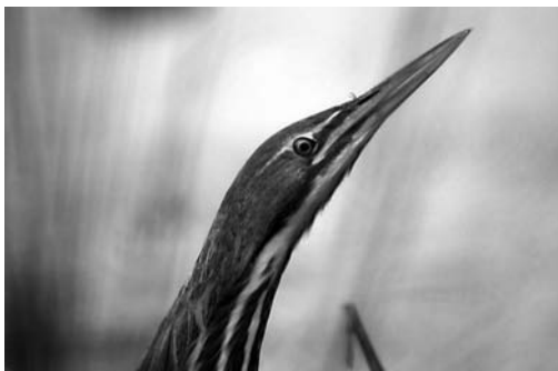
American Bittern by Leonard Medlock, 1/6/07, "Henry's" Pool, Hampton, NH.