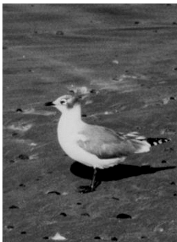
Franklin's Gull, 9/17/91, Jenness Beach, Rye, NH.