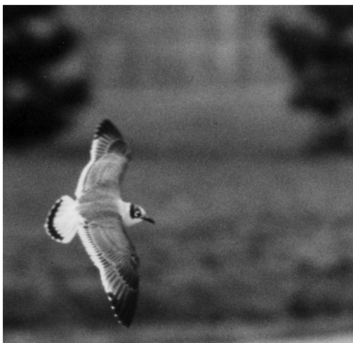
Franklin's Gull, 11/25/1970, South Mill Pond, Portsmouth, NH.