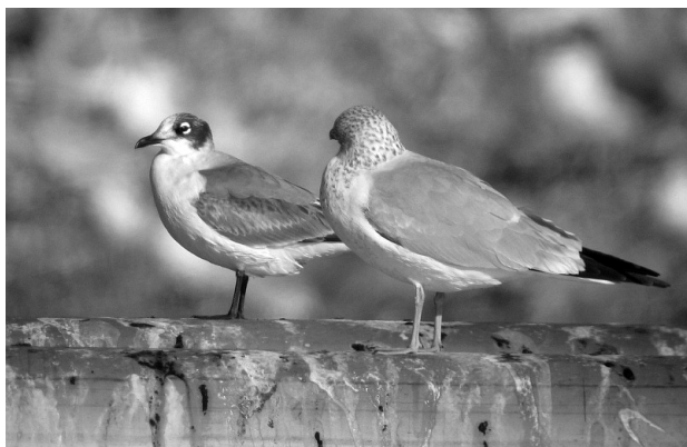
Franklin's Gull, 11/8/05, Rochester WWTP, Rochester, NH.