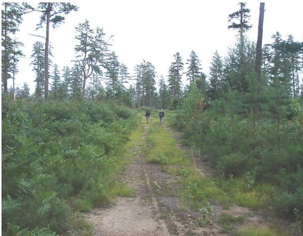
Ossipee Pine Barrens at Red Baron Gate.