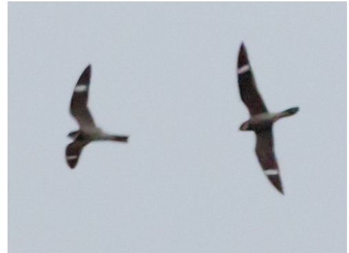
Nighthawks in chase are difficult to photograph but the white throat of these males still stands out.