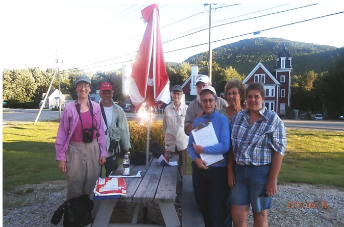
Ossipee volunteers.

Ossipee was very busy this season with record numbers of birds since we began watches in 2012. Volunteers observed 9 nighthawks during one watch at the Red Baron Gate including two possible chicks flying. During one watch four volunteers took up stations in one area so that more accurate observations could be made during the frantic evening activity.