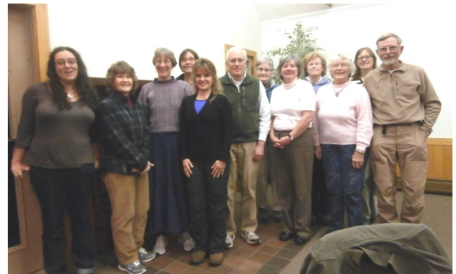
2014 Goatsucker Gala at the McLane Center.