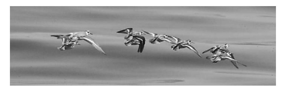
A single Red Phalarope (far left) with a flock of Red-necked Phalaropes, by Jon Woolf.

in the Gulf of Maine in July, and peak in numbers around late August and September. Red-necked Phalaropes are usually much more common in the Gulf of Maine than Red Phalaropes. So they were on our trip: we saw more than a hundred Red-necked Phalaropes, with a handful of Red Phalaropes mixed in.