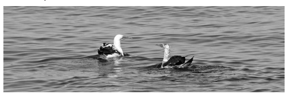
Two Northern Gannets in different plumage stages, by Jon Woolf. The amount of white indicates age: the bird on the left is almost mature, while the browner bird on the right is younger.

Northern Gannets are usually common sights offshore in September. We saw many of them throughout the trip, including one large group of over 100 in a floating roost. A gannet's plumage changes throughout its first four years in much the same way as a large gull's does, developing stage by stage from all-brown in a hatch-year bird to the full adult plumage of white with black wingtips and yellow head. Most of the gannets we saw were mixed brown and white, or mostly white, indicating young birds from one to three years old.