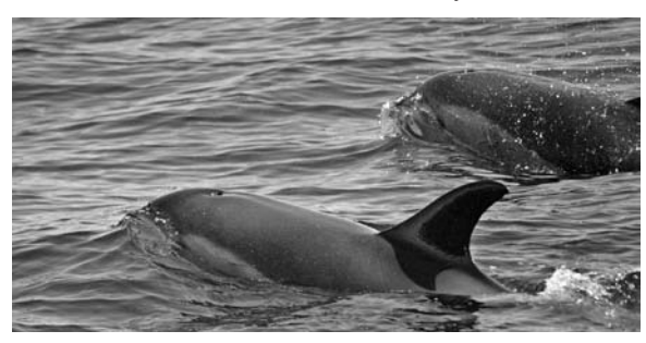
Two Atlantic White-sided Dolphins swim close alongside the boat

an encounter with a boat propeller. Finally, we saw several groups of Harbor Porpoises—not a rare animal, but a rare sighting. Harbor Porpoises are so small that any kind of wave action makes them nearly invisible.